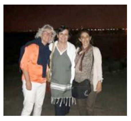
"Likewise, a group of collaborators was formed in the spring of 2017.

The support of IAAR to PRH in Morocco pays off. At the end of 2017 Morocco welcomed its first educator. She lives in Rabat.